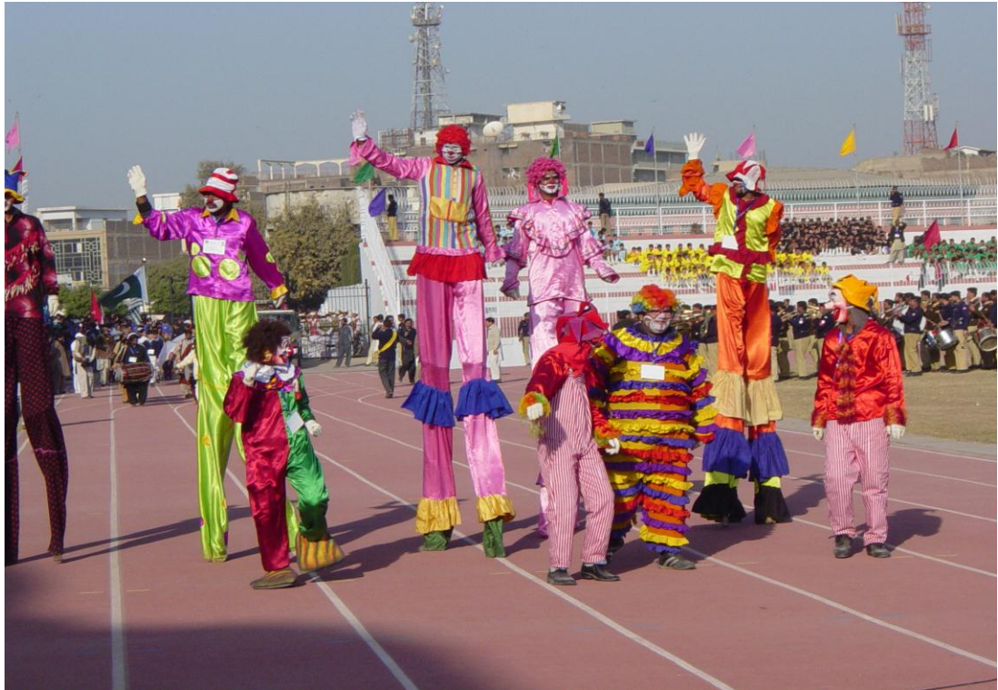
Jokers at the Opening Ceremony of the 31 st National Games

Due to shortage of time and holidays, HEC Sports division worked day and night to raise the teams on merit in a transparent manner and also made arrangements for participation in the National Games. Directors Sports of the Universities provided full cooperation in holding of Intersarsity Championships in shortest possible time and for the selection of HEC teams on merit. Recommendations of the Committee for selection of HEC teams constituted during its 44 th meeting were followed.