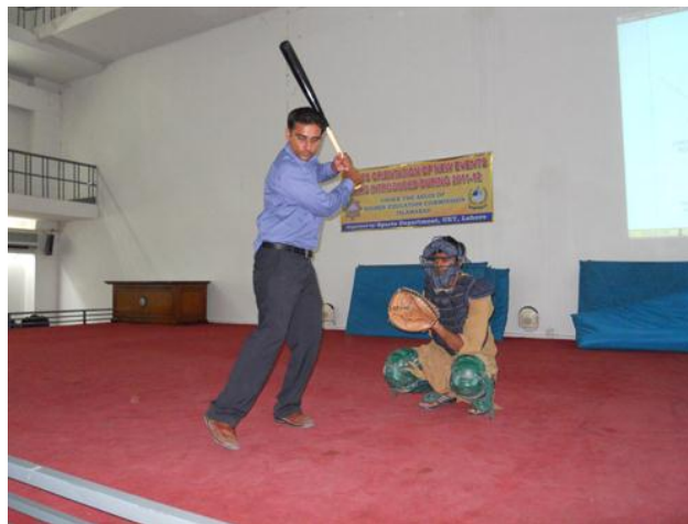
Baseball & Judo demonstrations at UET, Lahore during the course

The Sports Division has introduced 6 men and 10 women events from the session 2011-12. These events were all new to most of the universities so an orientation course was organized at Mehran University of Engg & Technology Jamshoro, University of Engg & Technology Lahore, Quaid-e-Azam University Islamabad and HEC Regional Center Peshawar from 26 th to 30 th June 2011. All Public/Private sector Universities/Institutes were invited to attend the course. About 164 officials/officers from universities participated in this course.