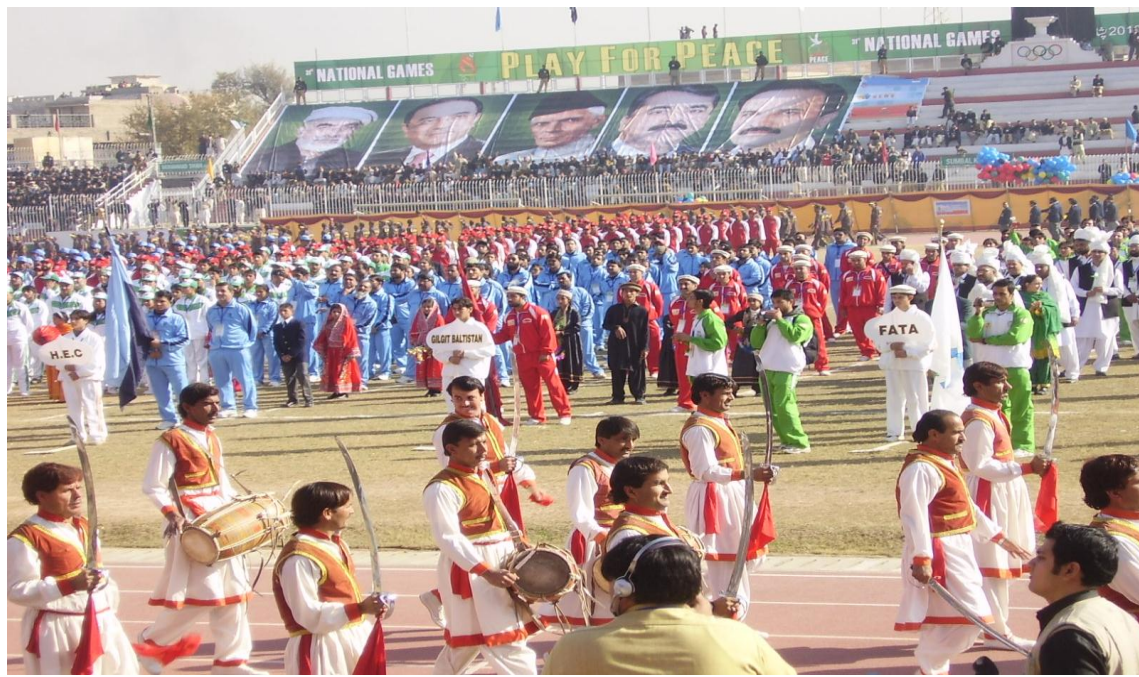
HEC Squad in Blue Color at the Opening Ceremony of the 31 st National Games

Coach of HEC team was selected from the first three position holder teams of the Intervarsity Championship of the relevant event on merit in consultation with the HEC team Manager.