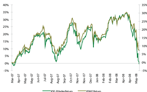
KSMF vs Benchmark