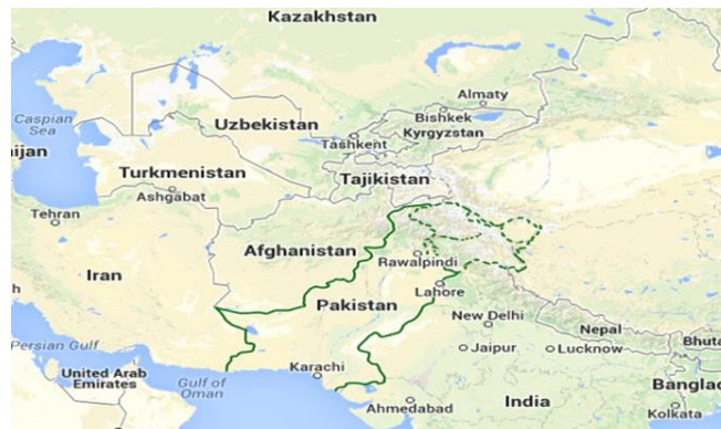
Figure 2: Pakistan's strategic location

In particular, transit trade through the new Gwadar port could bring huge dividends. The port is located on the coast of the Arabian Sea, approximately 75 km east of Iran's border with Pakistan and 400 km from the Strait of Hormuz, which is the only sea passage to the Persian Gulf