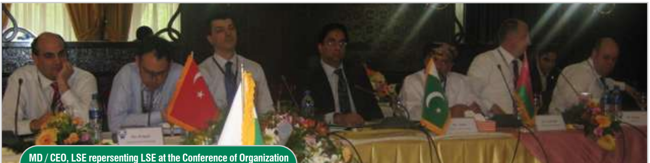
MD / CEO, LSE representing LSE at the Conference of Organization of Islamic Countries Stock Exchanges (OIC) held in Tehran, Iran.