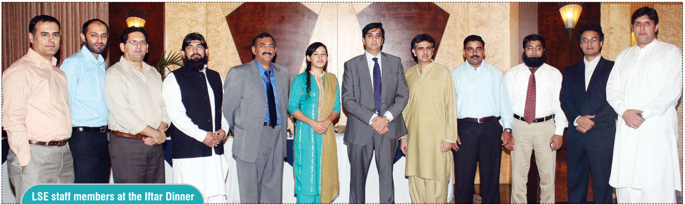
LSE staff members at the Iftar Dinner (Royal Palm Golf & Country Club).