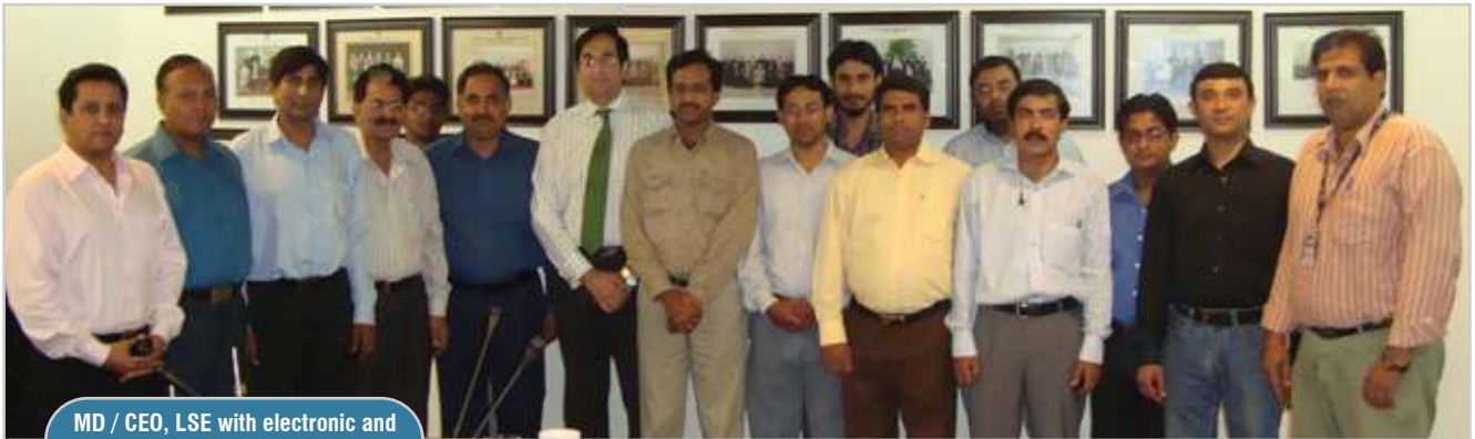
MD / CEO, LSE with electronic and print media on their visit to LSE