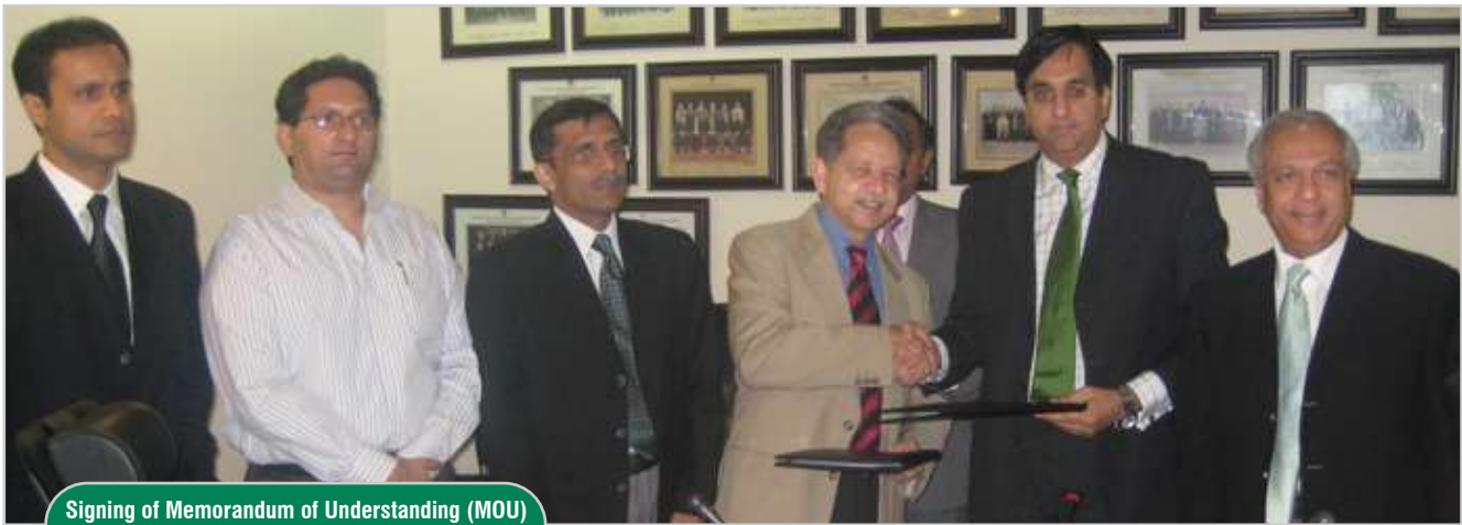
Signing of Memorandum of Understanding (MOU) with NIFT.