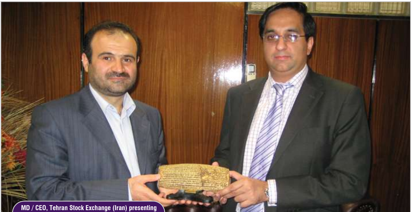
MD / CEO, Tehran Stock Exchange (Iran) presenting a souvenir to MD / CEO, LSE on his visit to Iran.